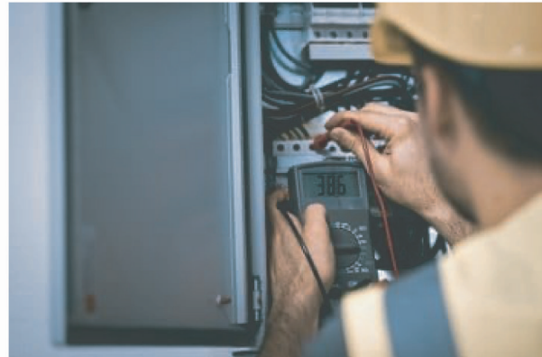
Healthiness Check-up of Capacitor Panels & HT Capacitor Banks