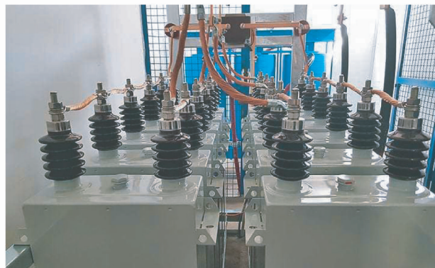
Healthiness Check-up of Capacitors & Reactors