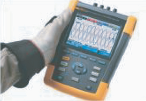
PQ & Harmonic Analysis Study