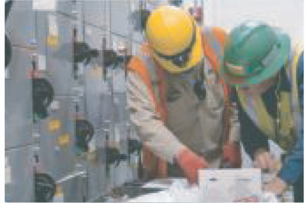
Annual Maintenance Contract